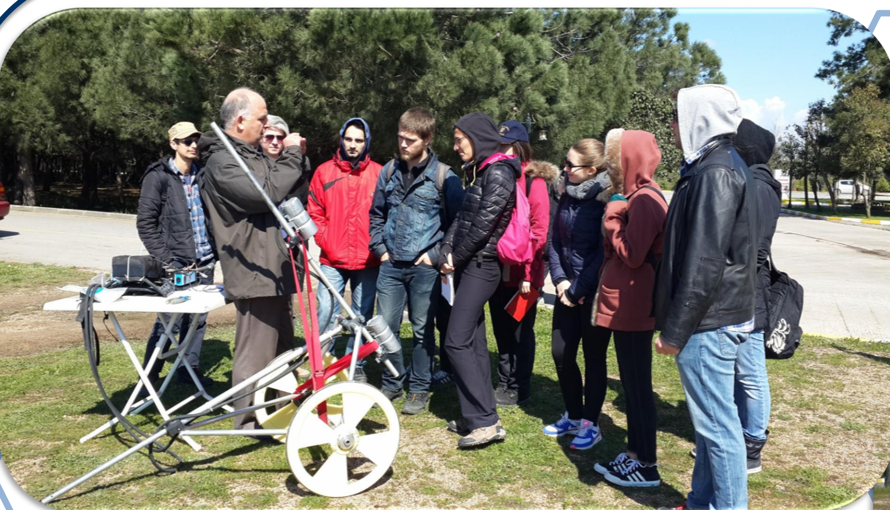
Magnetic Gradient Measurements