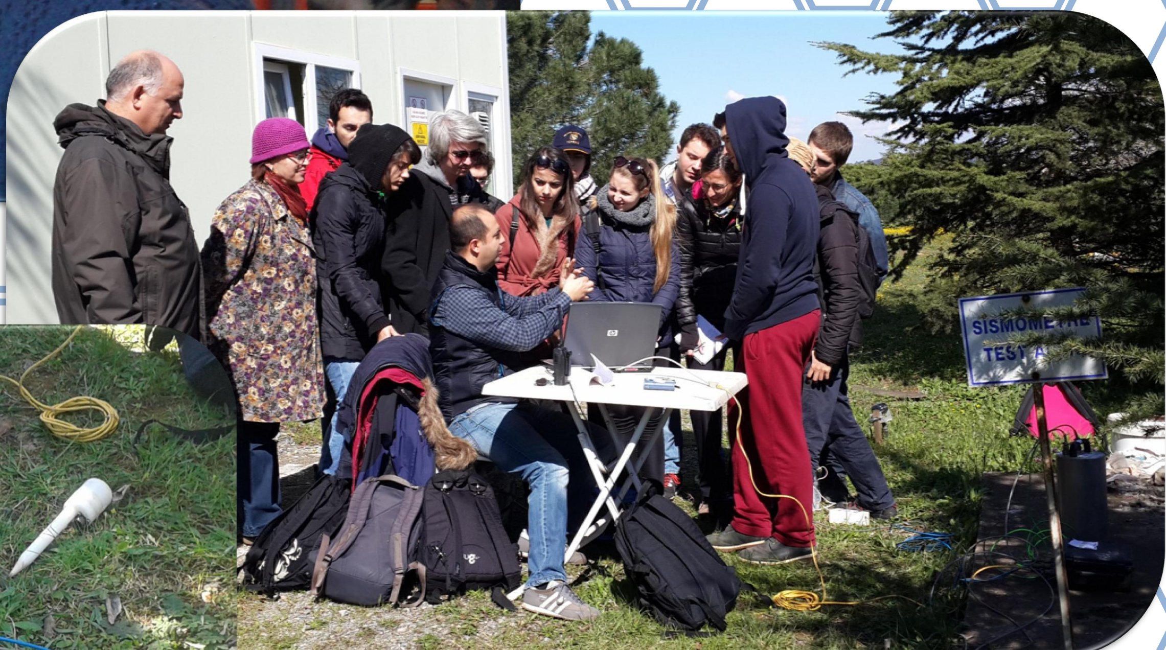
Installation of an Earthquake Monitoring Station